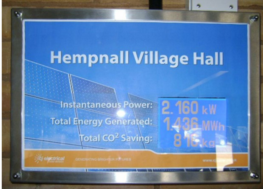
CJ Solar: Commercial solar PV case studies