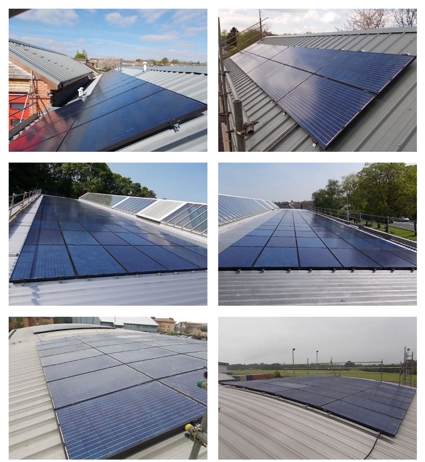
CJ Solar: Commercial solar PV case studies