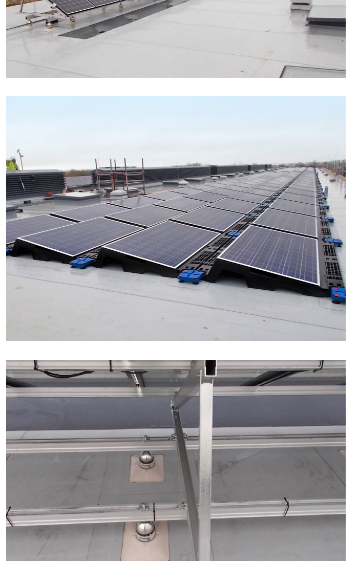
CJ Solar: Commercial solar PV case studies