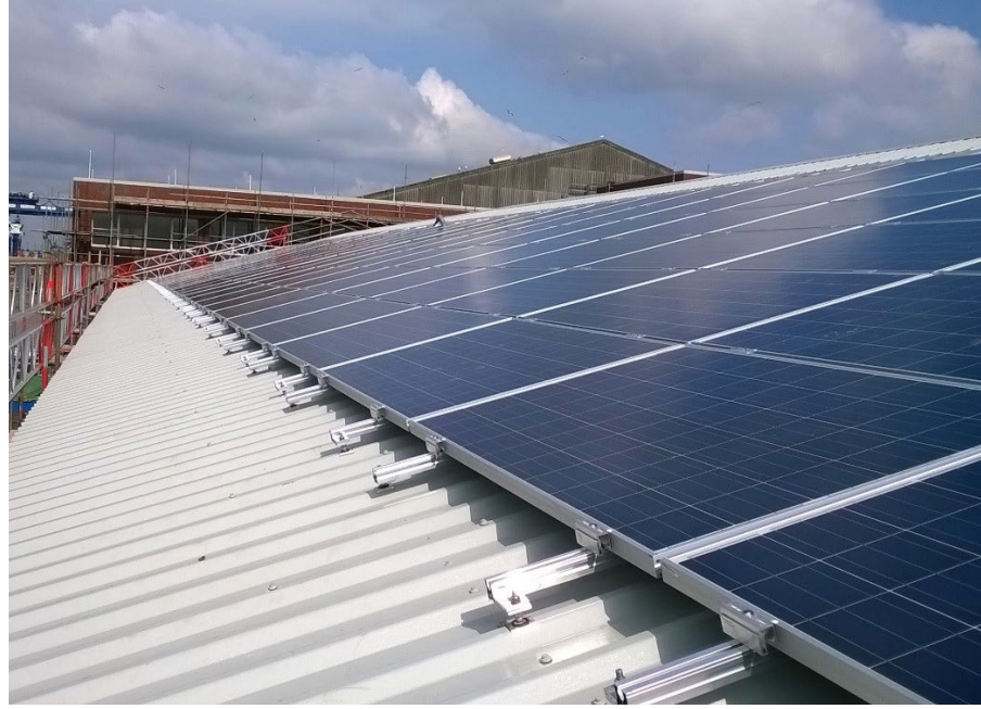
CJ Solar: Commercial solar PV case studies