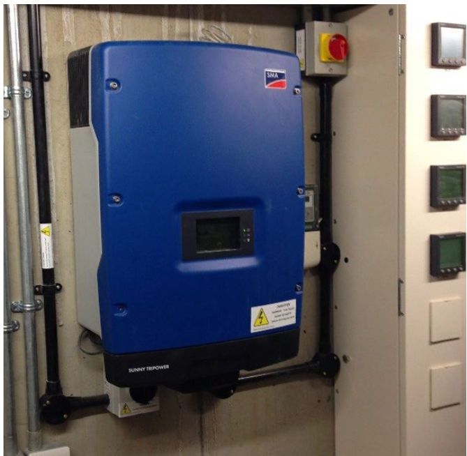
CJ Solar: Commercial solar PV case studies