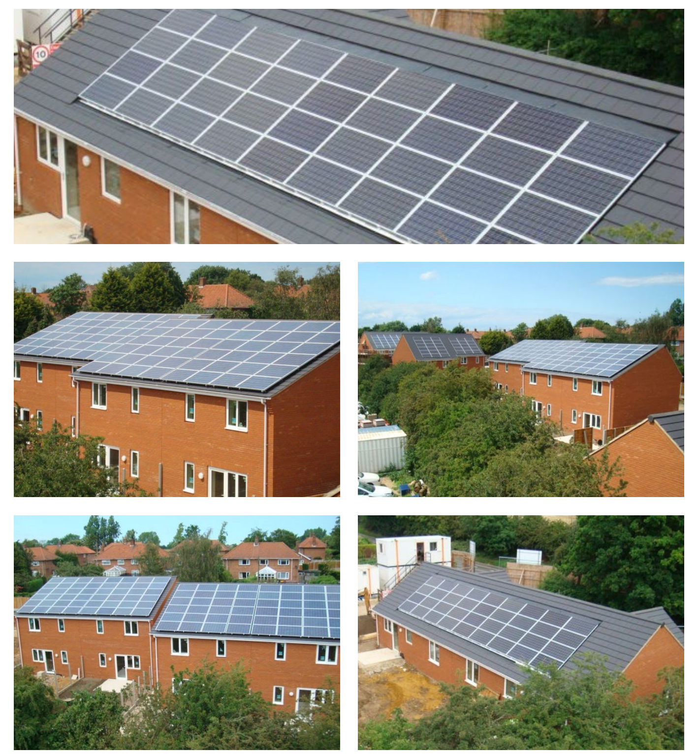
CJ Solar: Commercial solar PV case studies

6 × 5000 TL SunnyBoy 4 × 4000 TL SunnyBoy 2 × 3000 TL SunnyBoy 2 × 2500 TL SunnyBoy