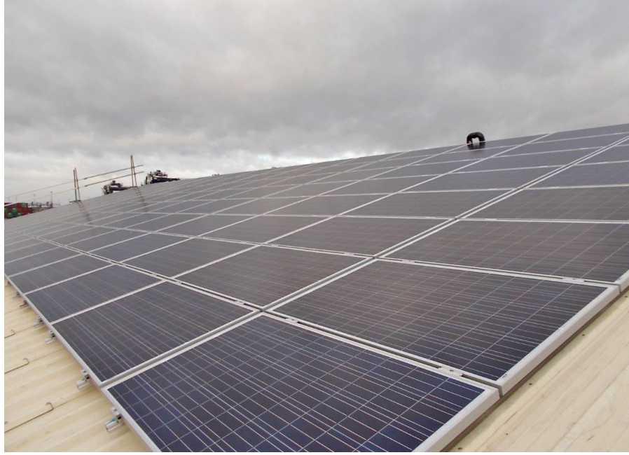
CJ Solar: Commercial solar PV case studies