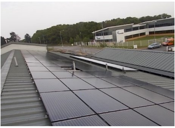
CJ Solar: Commercial solar PV case studies